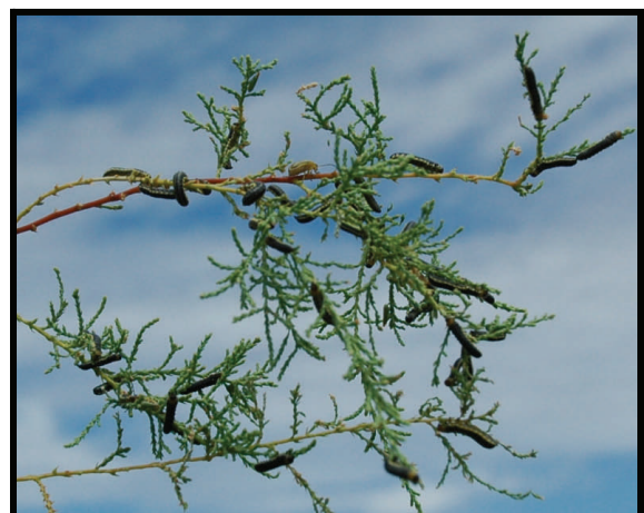
Saltcedar trees defoliated by the Tunisian leaf beetle and larvae feeding on the few green branches remaining. Balmorhea Reservoir, Reeves Co, TX. July, 2012.