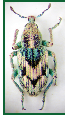
The Coniatus weevil is very small, 4-5 mm long, and brightly colored.

young leaves at the end of branches. In Texas, significant leaf or branch feeding has not yet been observed.