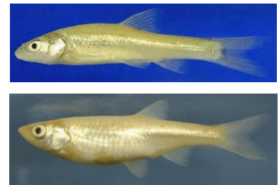
Sharpnose and Smalleye Shiners

http://www.texasahead.org/texasfirst/species/fact_sheets/